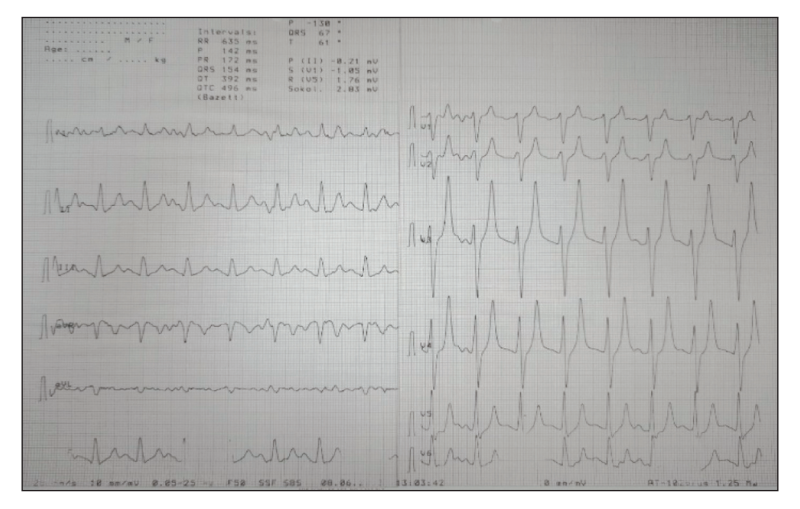
FIGURE 1: Electrocardiogram demonstrates peaked T waves consistent with hyperkalemia

According to the patient's findings, acute renal failure and emergency dialysis indication were considered, and internal medicine was consulted. Urgent haemodialysis was applied to the patient, who was followed up in the intensive care unit. Haemodialysis was applied to the patient for 3 consecutive days, after which it continued every other day. During his stay in the hospital, erythrocyte suspension was inserted, and a hemogram was followed. Antibiotherapy treatment and hydration were started. Considering partial postrenal obstruction, the urology implanted a left-sided double J stent. Urine output was 2,000 cc/day. Renal failure was thought to be related to the use of analgesics. A kidney biopsy was not performed on the patient. Blood and urine tests were done. Anti-nuclear antibody and hepatitis tests were negative. A urine culture was taken due to elevated CRP and leukocytes in the urine test. Acinetobacter spp. and Enterococcus faecium were found to grow. Tamsulosin hydrochloride and piperacillintazobactam were added to the treatment. Fundamental examination showed signs of Grade-2 hypertensive retinopathy. The echocardiography report showed Type 1 diastolic dysfunction, mild mitral insufficiency, and left ventricular concentric hypertrophy. After 21 days of follow-up, urea decreased to