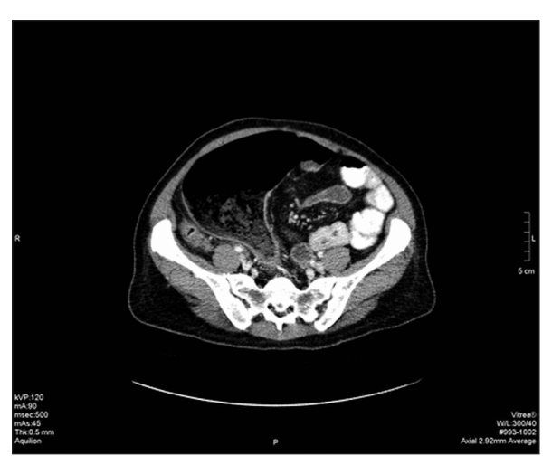
FIGURE 2: Abdominal computed tomography axial plane.

In conclusion, sigmoid volvulus should be considered in elder patients with chronic constipation and using psychoactive drugs who admitted with severe abdominal pain. Sigmoidoscopy is the easiest and cheapest procedure for both confirming diagnosis and treatment.