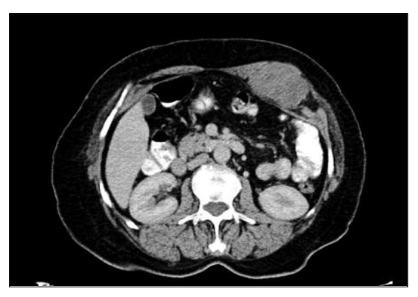
FIGURE 1: CT examination revealed desmoid tumour located between abdominal wall muscles.

Desmoid tumors are rarely seen mesenchymal tumors. They are also called as aggressive fibromatosis and musculoaponeurotic fibromatosis. A tumor occurring in the abdominal wall of a woman after delivery was described by McFarlane for the first time in 1832. However, description of desmoid tumor was used by Mueller in 1838. 5,6 Its incidence was 2-4 per million. It is commonly seen in young females. Male/Female ratio is 1/2. Although they are