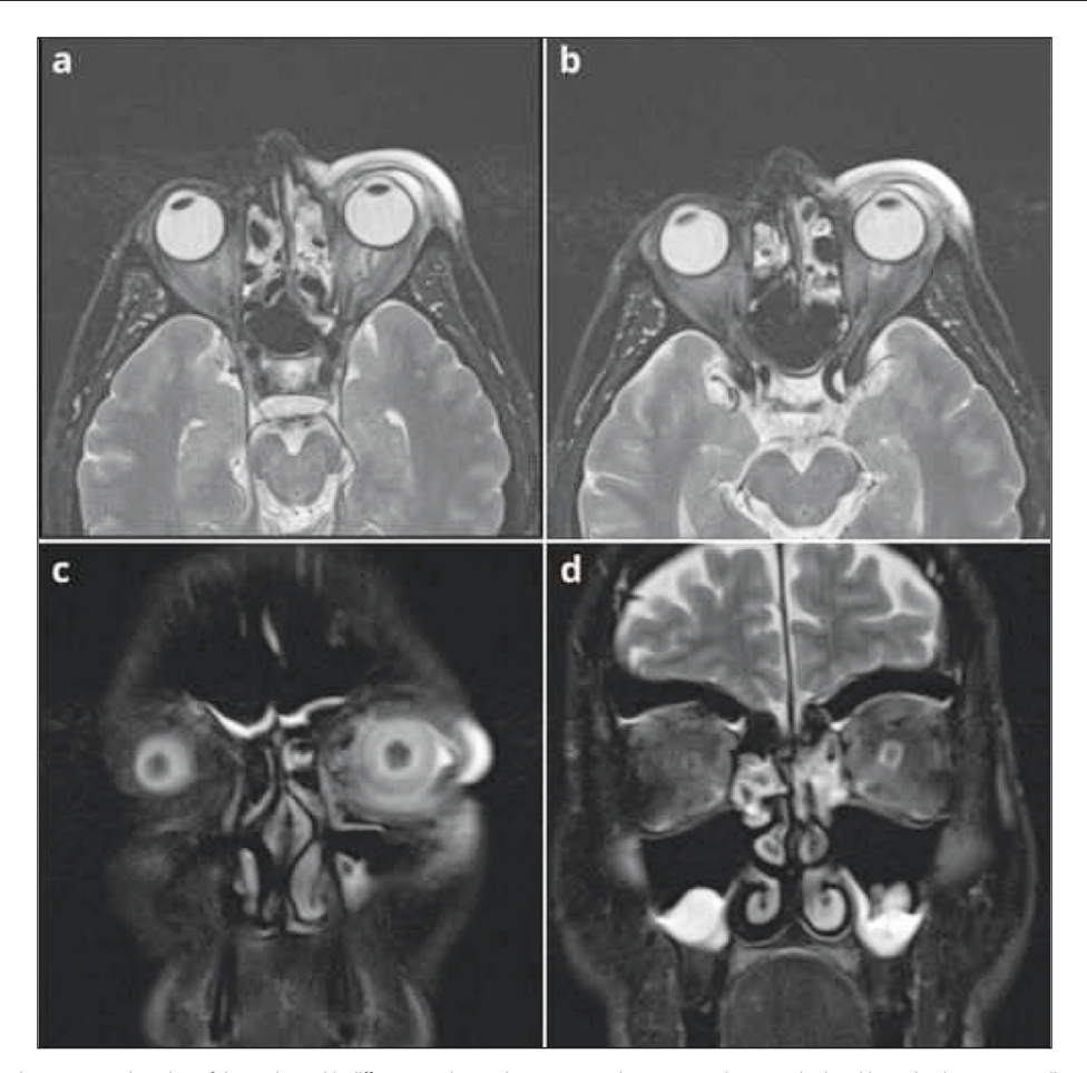
FIGURE 3: Magnetic resonance imaging of the patient with different angles and sequences, there was an increase in the skin and subcutaneous distance in the soft tissues around the left eye orbit and an increase in the cerebrospinal fluid distance around the optic nerve, orbital cellulitis.