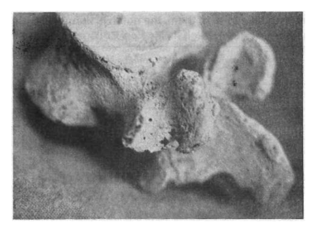
Figure 2. View of vertebrae L5 with 3/4 notch on the left side (arrows).