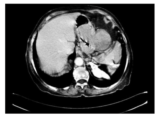
FIGURE 2: Abdominal CT showed well defined round mass in the stomach.