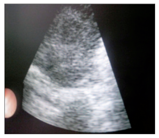
FIGURE 1: Ultrasonographic view of a lymph node located at 4R position. (See for colored form http://tipbilimleri.turkiyeklinikleri.com/)