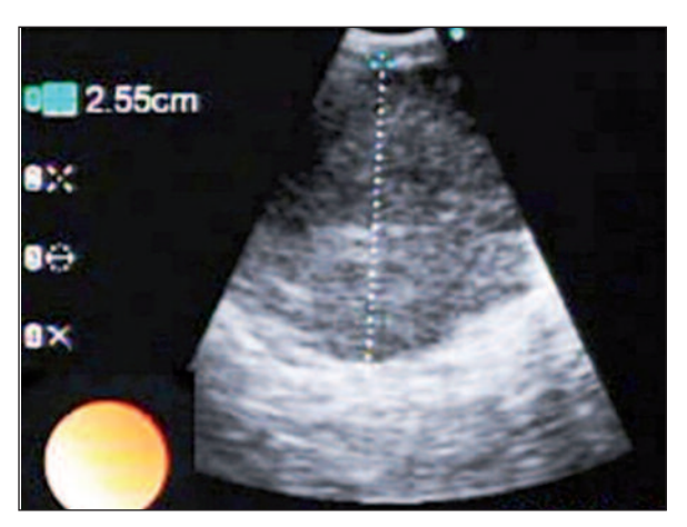
FIGURE 2: Measuring the diameter of a lymph node. (See for colored form http://tipbilimleri.turkiyeklinikleri.com/)