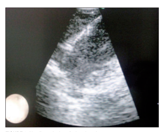
FIGURE 3: Needle aspiration of a lymph node. (See for colored form http://tipbilimleri.turkiyeklinikleri.com/)

a single needle since since using different needles would increase the expenditures; therefore we sampled the lymph nodes in an prearranged manner. N3 nodes were sampled first, and then N2, and at last N1 nodes were punctured.